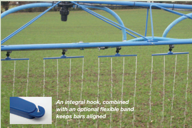
An integral hook, combined with an optional flexible band keeps bars aligned

Using a clever quad-valve system encased in a specially developed rubber sleeve, the AutoStreamer allows the operator to achieve, if required, a ten-fold increase in flow rates from only a three-fold increase in pressure.